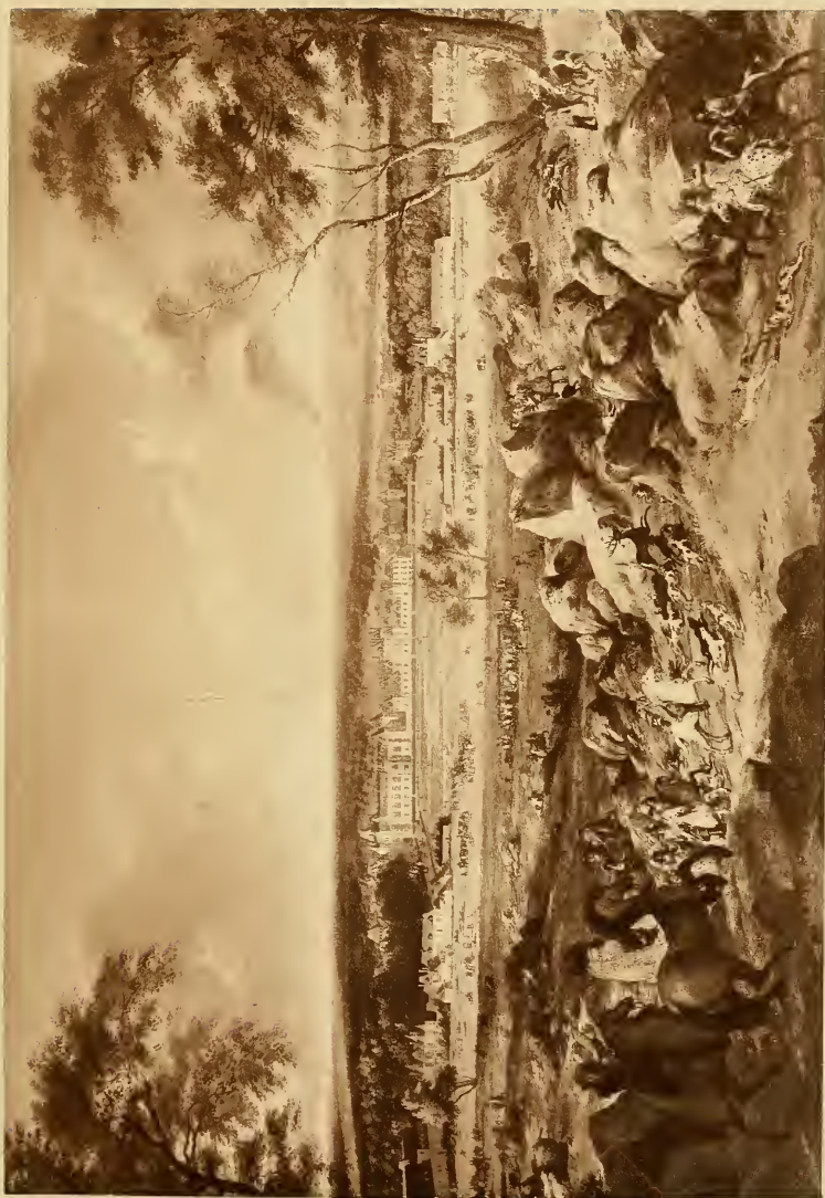
A. Hunt at Fontainebleau